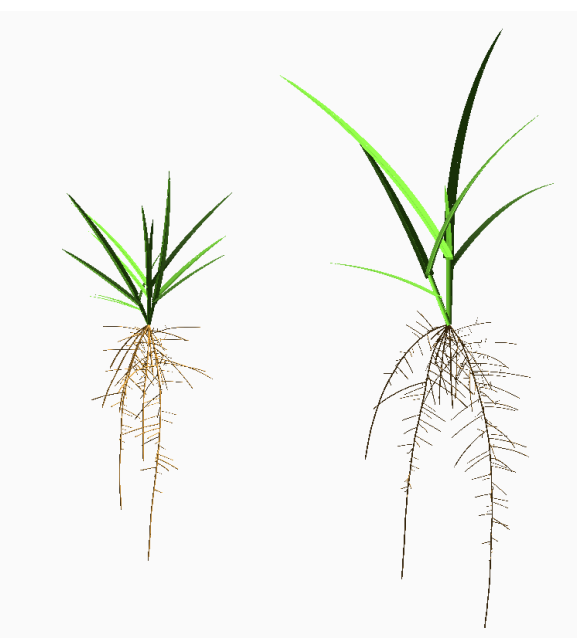
Fig. 1. Results of simulations of two ryegrass plants with different morphologies, at the same age of development, (Short Leaves (left); Long Leaves (right))

The model allows simulating the development of ryegrass plants with different morphologies. For example, two contrasting genotypes (Hazard et al. , 1996) developing short or long leaves were simulated (Fig. 1).