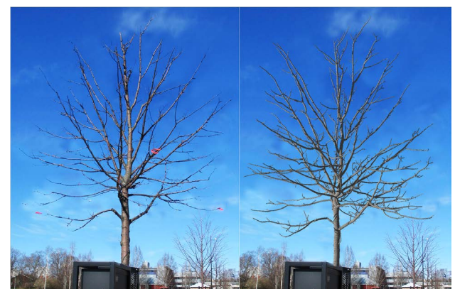
Fig. 1. Example of a lime tree reconstruction with the method of Preuksakarn et al. (2010). Left: an original picture of the tree. Right: the reconstructed virtual model inserted into same background.

While these methods produce realistic structures as shown by Fig. 1, no method to compare them quantitatively or evaluate their respective accuracy has been proposed so far. Such evaluation is of major importance for further exploitation of reconstructed models in biological applications. In this work, we address the problem of evaluating the accuracy of reconstructed structures from laser scanner data. For this, we first present a software tool that allows experts to define reconstruction from the point cloud. Using these expert-defined structures that will be considered as reference, we then propose different indices and algorithmic methods to quantify the similarities and differences between automatically reconstructed and reference structures. Such indices make it possible to compare the reconstructions made with the different methods proposed in the literature.